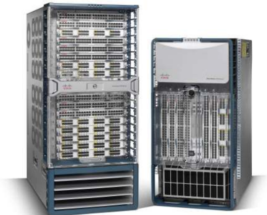
Figure 1. Cisco Nexus 7000 Series: Nexus 7018 and Nexus 7010

This document begins with a brief introduction to the Wireshark protocol analyzer and describes the Wireshark-like functions provided by Cisco NX-OS. The document explains how to use the Wireshark protocol analyzer for real-time analysis of control-plane and data-plane traffic. This document also summarizes factors to consider when using this function and the effect it can have on Cisco Nexus 7000 Series supervisors' CPUs (Figure 1).